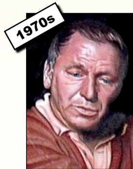
Ole Blue Eyes