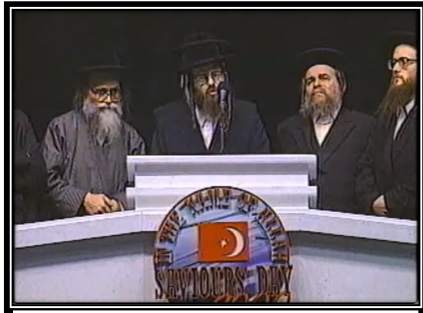
Figure 1 - Saviours' Day, February 27, 2000

to share his stage at the annual convention of the Nation of Islam and to have some words to say on the Sunday program.